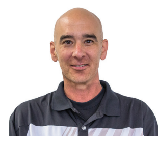
Armchair GM Did Panthers make the right draft day call?, 1B

Students excited to be part of tradition, 3B