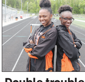
Pouble trouble Rocky River track has overcome hurdles, 1B